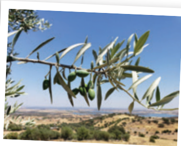
Visit to Monsaraz, a strategic hilltop enclave dating back to 1700