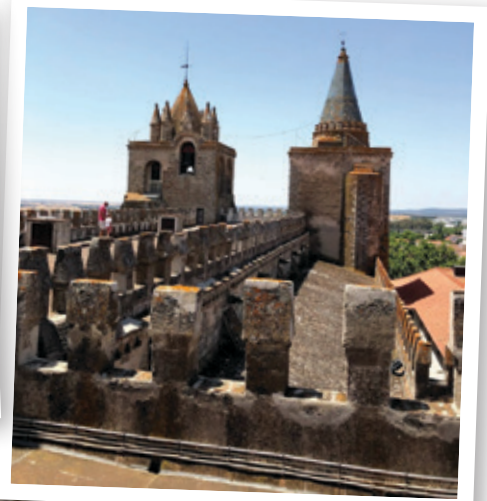
Catedral de Evora