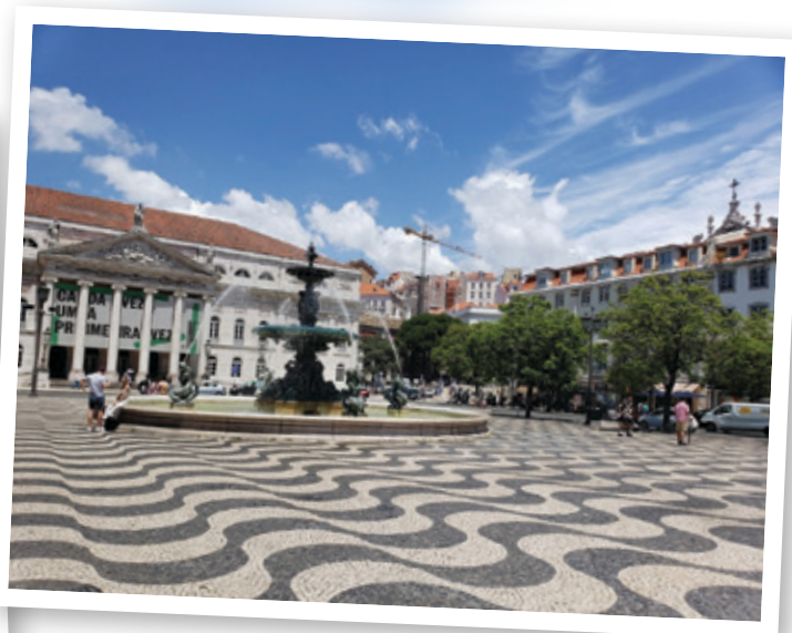
Left: Rua Augusta Arch, Lisbon Above: Wavy tile pattern of Rossio Square, Lisbon