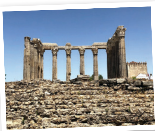
Evora Roman temple