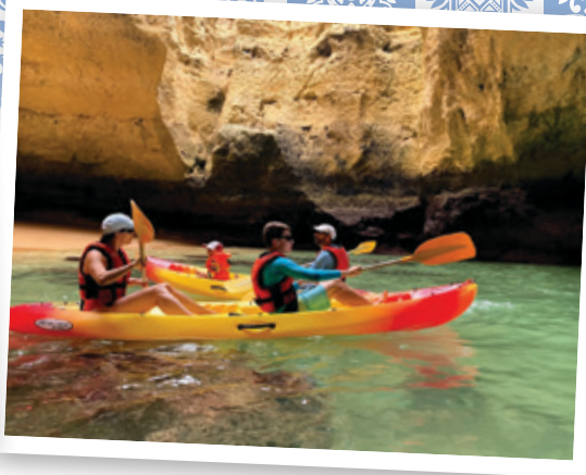
Kayak cave excursion

The kids also gave us a 50 th gift of a one-day rental of a Catamaran. That included a champagne lunch, touring along a longer stretch of coast, with a stop at a secluded beach all of our own — but with water just as cold. The locals said the water temperature warms up a bit in August.