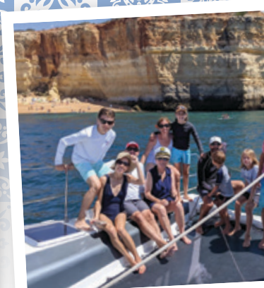
Catamaran tour of the beaches