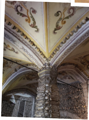
Chapel of Bones in Evora