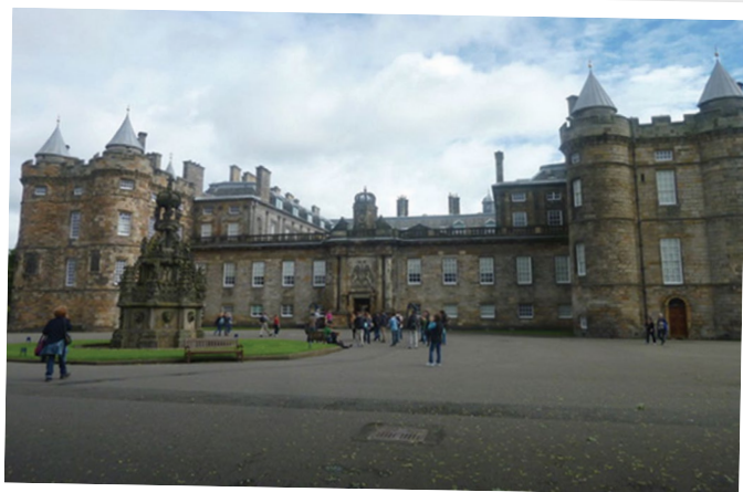
The Palace of Holyroodhouse

Okay, but the next day was beautiful, if a bit on the chilly