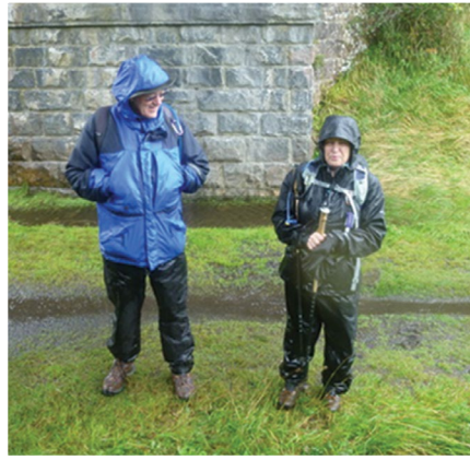
Sherry seeking shelter under an abandoned railroad bridge