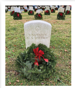
Laying of Wreaths at Knoxville National Cemetery Dec 2021