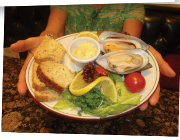
Delicious food awaited us at every turn.