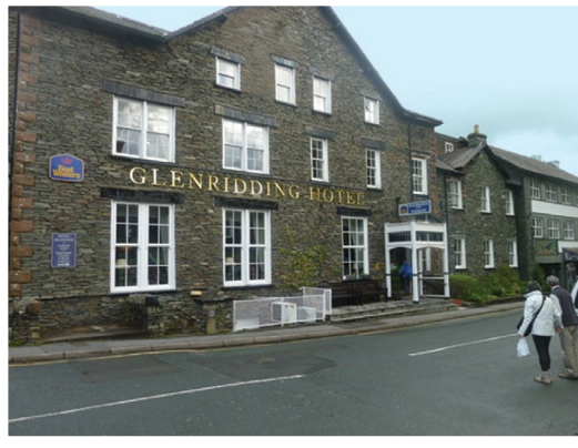
The nicest Best Western you'll ever stay in

Another day of rain and wind all day. The hiking the day before was 8 miles through waterlogged pastures. It was