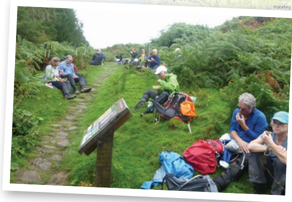
Lunch without rain, at least at that moment

A word of praise for plastic baggies. You can never have too many baggies of all sizes on a rainy hike across England.