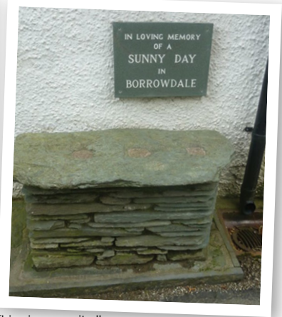
This sign says it all.

ladies and gents with absolutely marvelous senses of humor. They were a real treat.