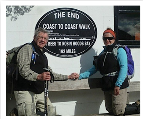
The end of the trail at Robin Hood's Bay

Believe it or not, we both were rather tired of large dinners,