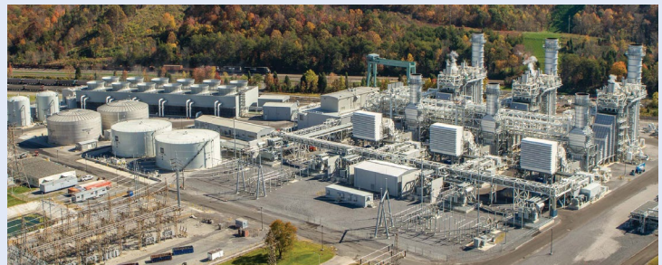
John Sevier Combined Cycle Gas Plant

That commitment paid off in February 2021, when bitter cold left millions in Texas, Arkansas, Oklahoma, and Mississippi without power and caused six days of rolling blackouts. Under those same frigid conditions, TVA's