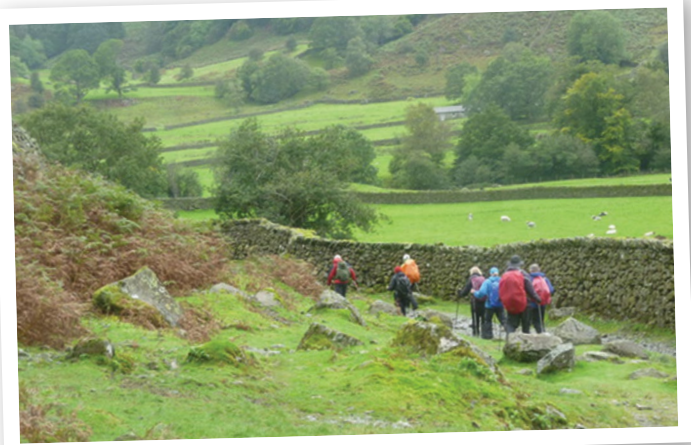
Looks like a bit of sun today

The next day was more of the same. We did, however, learn to make better use of our raingear and baggies. Our gaiters were invaluable in this type of activity, an absolute necessity. We got pretty good at putting them on.