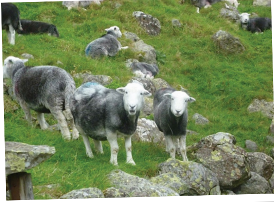
Watchful eyes along the trail