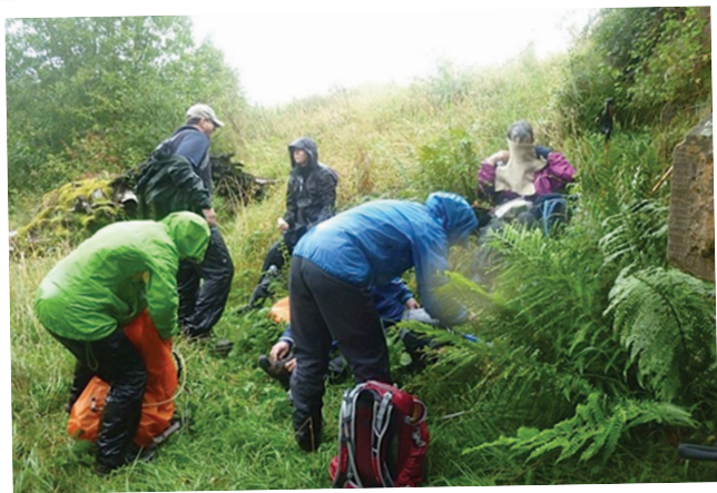
Another (much more typical) wet lunch on the trail

We checked into our B&B early and were involuntarily