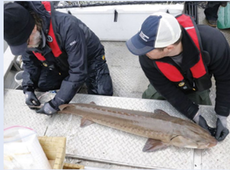
This 53-inch-long lake sturgeon showed up in annual survey conducted by TVA biologists.

Today, lake sturgeon are being reintroduced through a multi-agency, 30-year partnership involving the U.S. Fish & Wildlife Service, TVA, the Tennessee Wildlife Resources Agency, the Tennessee Aquarium, the University of Tennessee, and multiple other stakeholders.