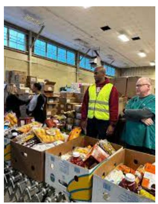
Boxes of food prepared by volunteers to be distributed

Please mark your calendar for September 14, 2023. We need you there at 8:00 and would like for you to stay until 11:00. If you can help, please text John Blackwell, 256-710-9022 or jpblackwell841@comcast.net.