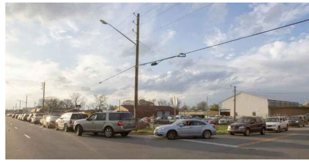
Cars wrapped around the Food Barrel Project in Sheffield AL

relief programs which immediately feed people in need. The Meal Barrel Project provides fresh fruit, vegetables, canned goods, bread and hygiene kits for people in need. The Meal Barrel Project currently serves anywhere from 329 to 500 families on a weekly basis and additional qualifying members of Colbert County. This project is the largest food project in the state of Alabama.