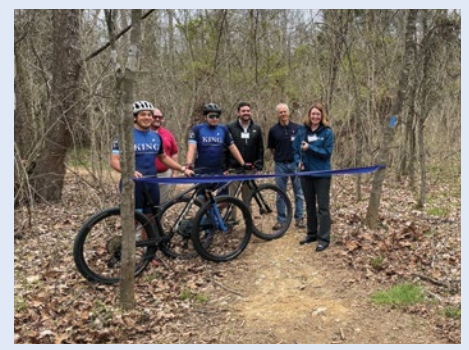
Ribbon-cutting for the new South Holston trail system

the trails add to nearby recreational opportunities including fishing, boating, skiing, kayaking, and more at South Holston Dam Reservation. And they are the first of their kind in the area for families to enjoy.