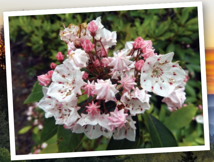
Mountain Laurel at Obed Wild and Scenic River

As TVA embarked upon its historic hydroelectricdevelopment, river-navigation, and flood-control projects in the 1930s and 1940s, one of the early objectives of agency planners was to encourage development of walkable, friendly downtown spaces where local commerce