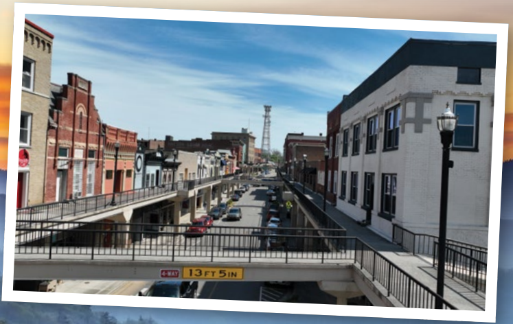
Historic downtown Morristown, Tenn.