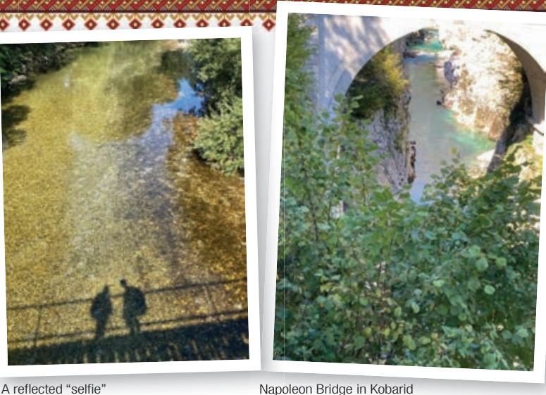
Napoleon Bridge in Kobarid

combination of beer and either lemon or grapefruit juice that is very popular with cyclists and hikers. We enjoyed it daily. The farmer did not speak English but took a credit card. Nice visit, relaxing and gazing at the cows.