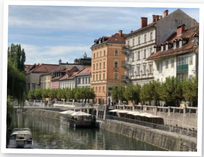
In Ljubljana, the capital and largest city of Slovenia

To access your monthly direct-deposit statements online, visit <u>bnym.accessmyretirement.com</u> and log in. Or create your account using your 15-digit BNYM account number found on any statement. On the website, you also can update your address, tax-withholding, or direct-deposit information. For assistance, call BNY Mellon toll-free at 1-844-545-1256.