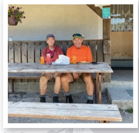
Radler Time on the trail

After checking into the Hotel Pokljuka, it was still early. We decided to hike backward on the trail we had skipped. Good thing we did, as we found a dairy farm that made great cheese and had Radler beer. Radler is a refreshing