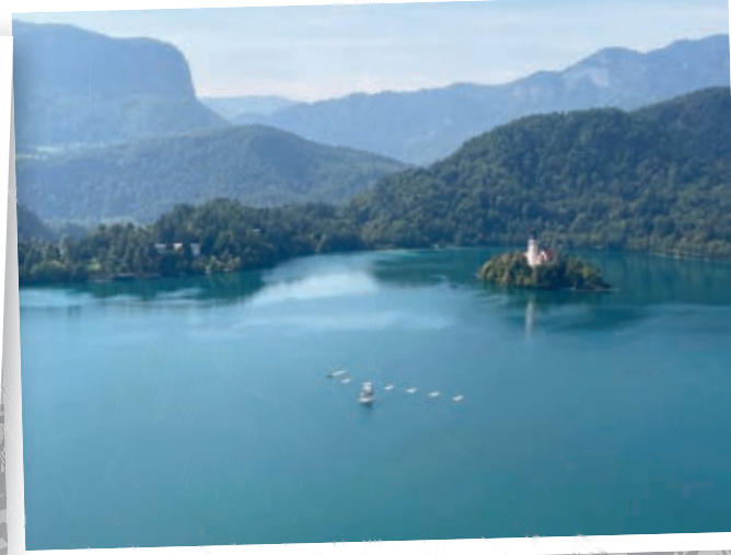
Picturesque Lake Bled, located in the Julian Alps, is a popular tourist destination.