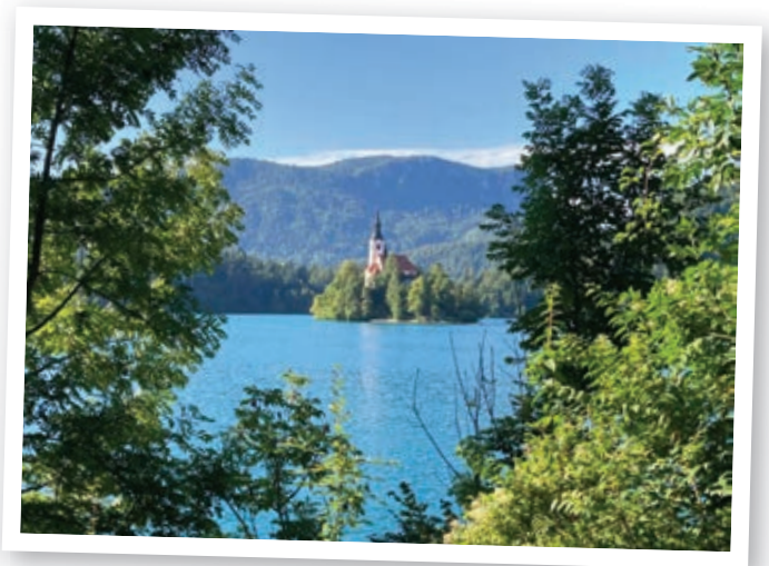
The Church of Mary the Queen on Lake Bled is also known as the Pilgrimage Church of the Assumption of Mary or Our Lady of the Lake.

The trail borders and goes into Triglav National Park, which surrounds Mount Triglav, Slovenia's National Treasure and at 9,400 feet the highest peak in the country. Our plan was to do 13 of the 16 stages, skipping the three that go into Italy. We did not want to deal with the border crossing and more Covid tests.