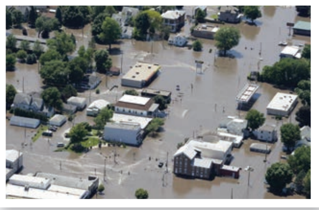
Waverly, Tenn., after devastating, deadly flooding hit Middle Tennessee this summer

Waverly was cut off from other nearby areas, and most parts of the area couldn't be reached until the next day when the floodwaters began to recede. Roads were flooded or washed away, and the westbound section of Interstate 40 was impassable.