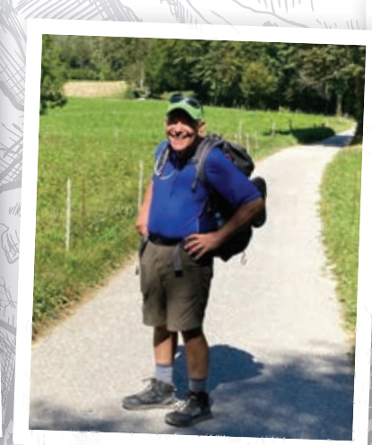
Another day, another trail, no goats