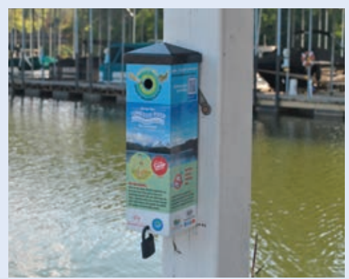
No buts about it, receptacles cleaning up waterways

Did you know cigarette butts, the world's most common litter, can contain enough toxins to kill aquatic life within two gallons of surrounding water? And that they also happen to contain tightly compacted microfibers of plastic in their filters that contribute to the plastic problem in our waterways when they're inevitably washed in by rain?