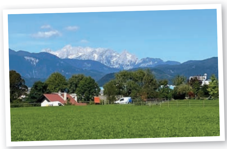
Mount Triglav, Slovenia's highest peak at 9,400 feet

The first thing we did was download a copy of the Juliana Trail Travel Guide and explore the trail in detail. It is a loop