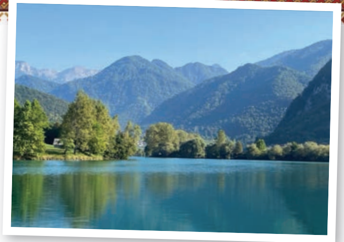
Another beautiful lake, this one on way into the Soca Valley

We eagerly started on our first day of the hike on a stage listed in the guidebook as a moderate 9½ miles taking