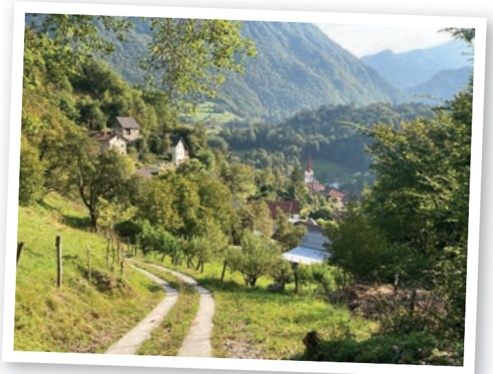
A sample of the beautiful scenery along the trail