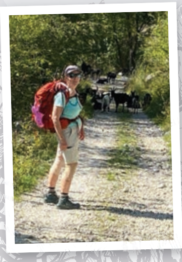
Goats blocking the trail (fortunately they moved easily away).

There were a lot of tourists around this location, and it was here that we met the only other couple also hiking the Juliana Trail. They were from Slovenia, so we hiked together