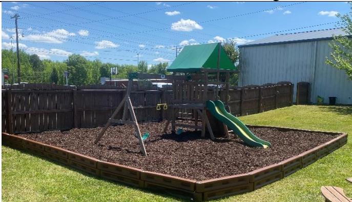
The completed project.