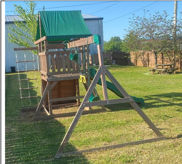
The Healing Place playground before.