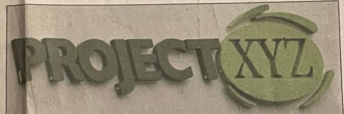
The former CBC INGS America plant in Muscle Shoals now is operating as Project XYZ.

The injection molding plant supplies North American