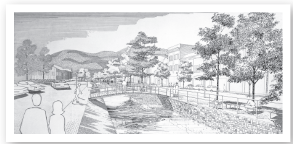
Sketch plan for proposed Townlift improvements at Coeburn, Va.

Interviews would be conducted, recorded, and transcribed, the focus to be primarily