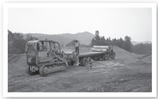
Early phase of construction of Thomas Village in 1978, a small residential development with energy-efficiency features designed by TVA to accommodate residents impacted by severe flooding at Clinchport, Va. "It's a thriving little place now."

The logistics of scheduling, preparing for interviews,