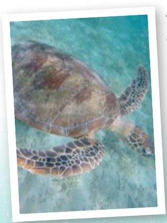
The very large sea turtle Jo Anne encountered snorkeling at the UNESCO World Heritage Site, Noumea, New Caledonia

We had a wonderful drive through several villages and observed the beautiful scenery and the Melanesian homes and gardens. We enjoyed a glass-bottom-boat ride and then lots of time for snorkeling. The view was amazing, with the crystal-clear water, green foliage, white sands, blue skies, and white clouds.