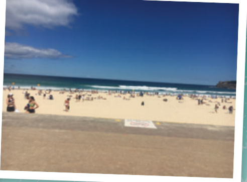
Bondi Beach, Sydney