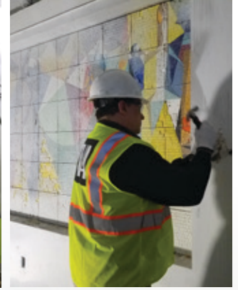
Workers carefully remove pieces of the Robert Birdwell mural at decommissioned Widows Creek Fossil Plant.

The lettering and tan marble are already part of the lobby at the new Paradise combined-cycle gas plant, while the bust is in the newly constructed Allen plant lobby with the white Alabama marble. Other items are being placed in the Chattanooga Office Complex.