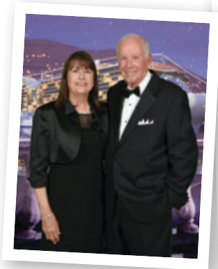
Dressing up for the occasional formal nights