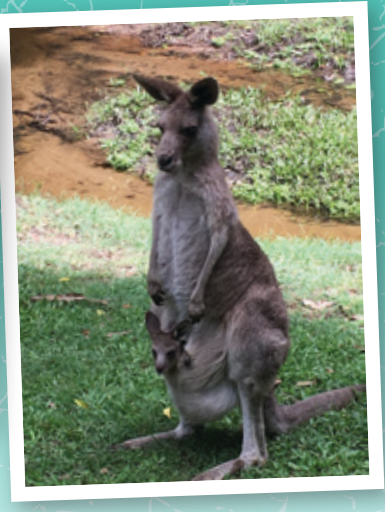
A sweet mother kangaroo with her joey at the Australia Zoo