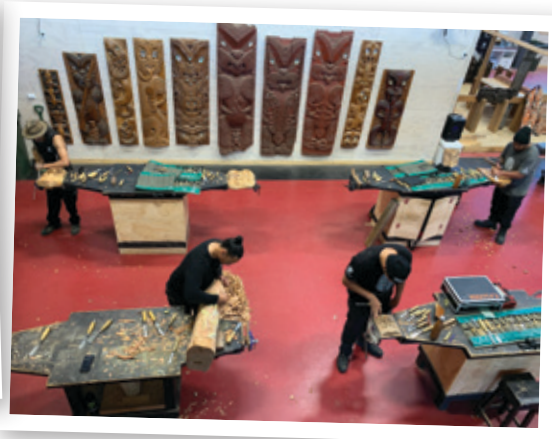
Young apprentices learn traditional wood-carving skills at the Maori Arts & Crafts Center in Rotorua, New Zealand.

pools, the beach, the ocean, a fantastic buffet lunch, and a performance of traditional Fiji dancing.