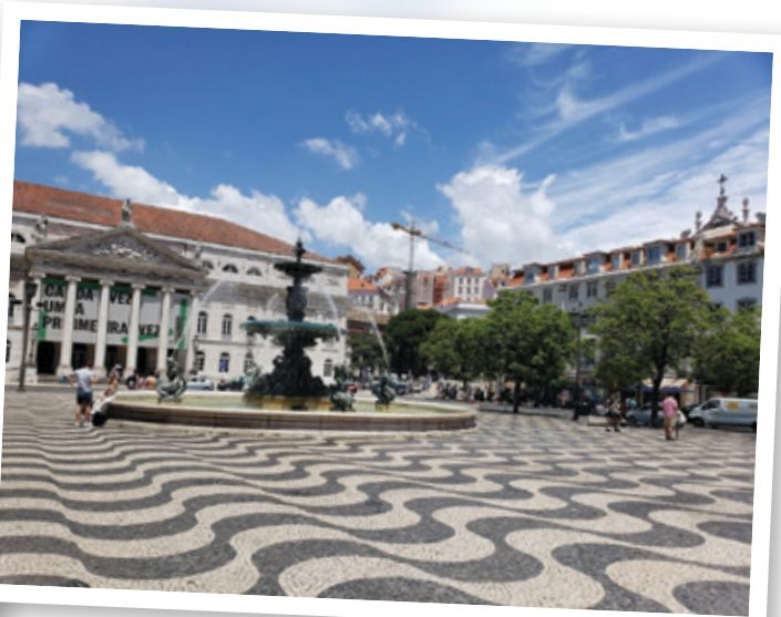
Left: Rua Augusta Arch, Lisbon Above: Wavy tile pattern of Rossio Square, Lisbon