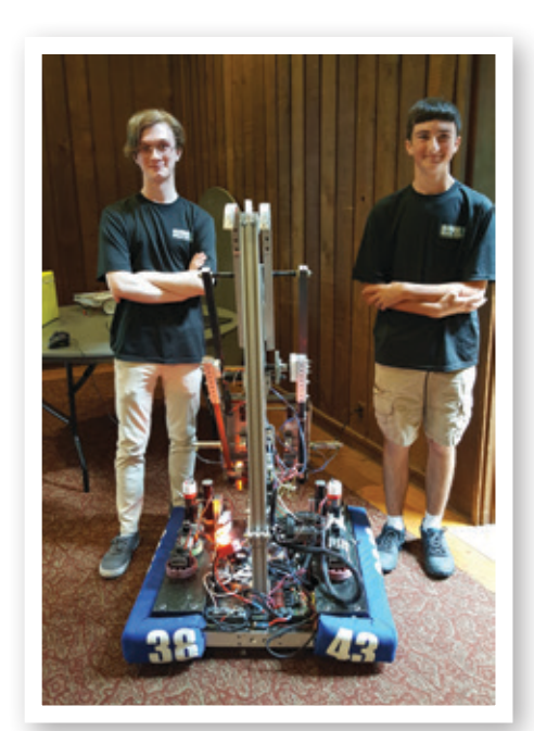
Calloway County Middle School students offer a robotics demonstration.

In recent years, program topics have included volunteer opportunities, local history, and updated TVARA information, and each December we