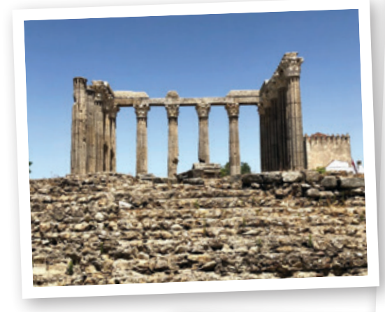
Evora Roman temple