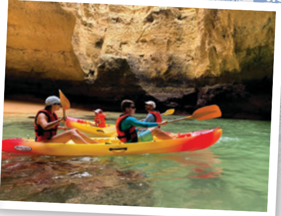
Kayak cave excursion

The kids also gave us a 50<sup>th</sup> gift of a one-day rental of a Catamaran. That included a champagne lunch, touring along a longer stretch of coast, with a stop at a secluded beach all of our own — but with water just as cold. The locals said the water temperature warms up a bit in August.