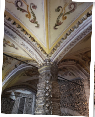
Chapel of Bones in Evora