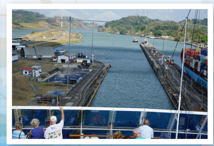
Panama Canal's Pedro Miguel Locks with Centennial Bridge in background