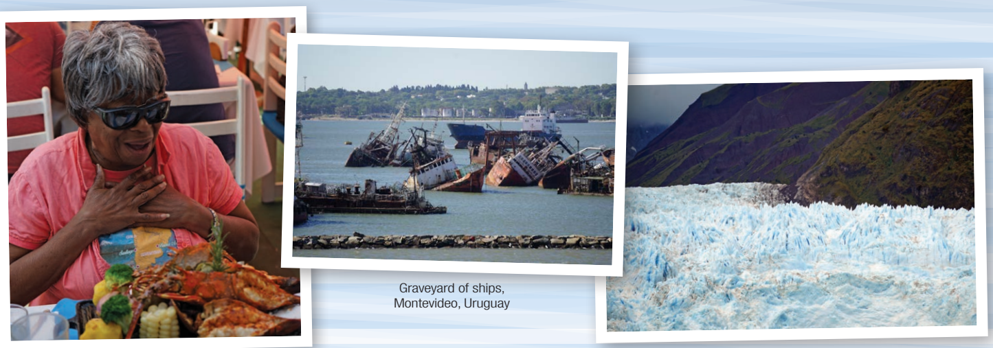
Lobster dinner in Miraflores, Peru