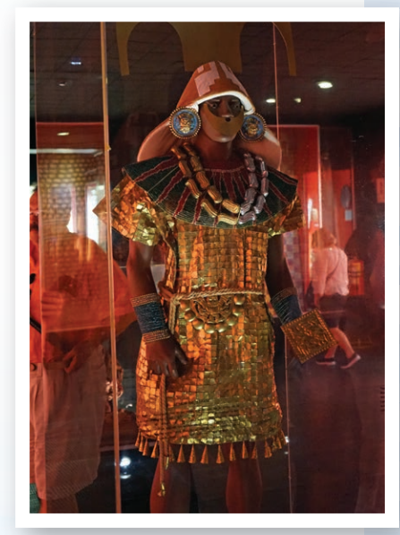
Inca Ceremonial Garment at the Museo del Auro (Gold Museum), Lima, Peru

Farther up the coast we viewed the 600-mile-long Atacama Desert, said to be the driest non-polar desert on the planet. It comprises much of the northern Chilean coast and