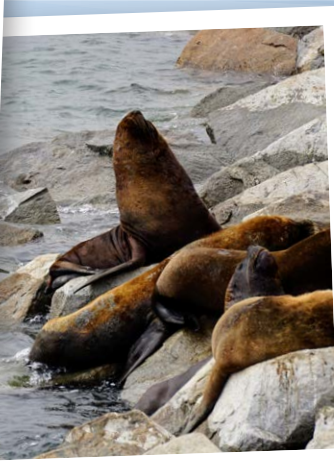
South American sea lions

photography of South American sea lions, colonies of Imperial Cormorants, and aggressive petrels.