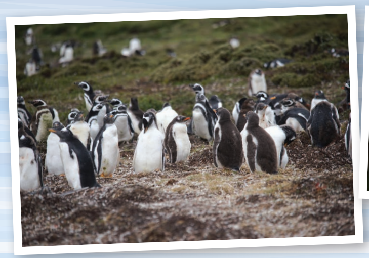
Gentoo and Magellanic penguins, Falkland Islands — Gentoo has nurse's-cap marking, Magellanic has circle around face.

where we encountered hundreds of Gentoo and Magellanic penguins.