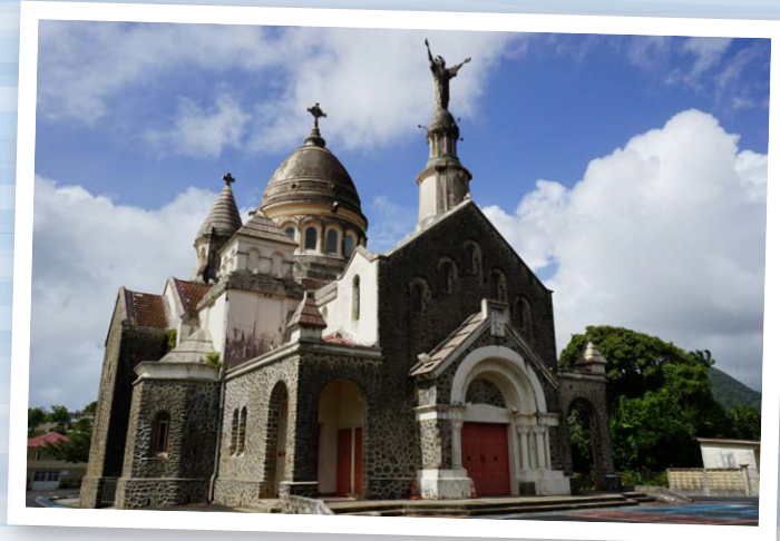
Sacré Coeur Cathederal of Balata, Martinique, West Indies

Lauderdale, Fla., on Jan. 24, heading southeast for St. Maarten, the first of five Caribbean islands we would visit on our southbound voyage.