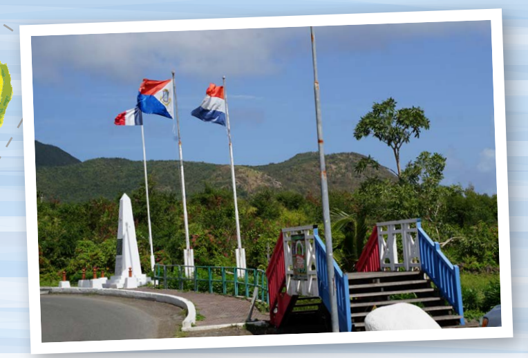
French, St. Maarten, and Netherlands flags posted at the border in St. Maarten, West Indies