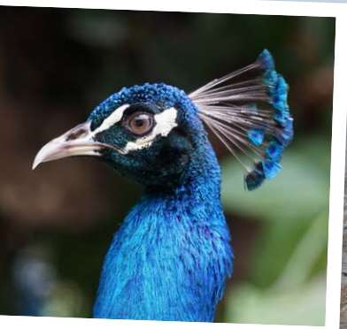
Free-ranging peacock, Cartagena, Colombia

It also provides tremendous opportunities for wildlife