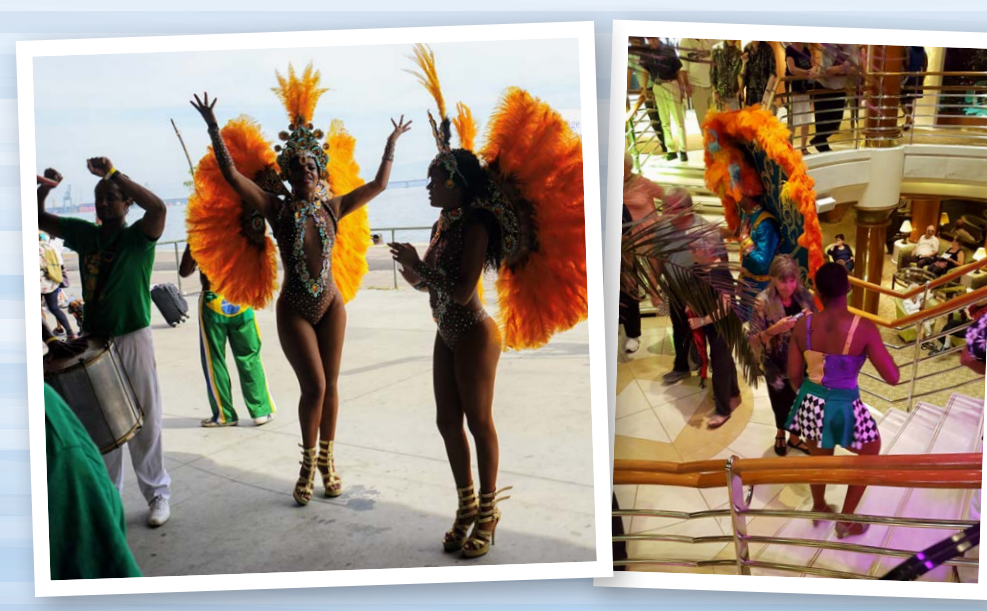
Greeters at Rio de Janeiro during Carnival

We visited the town of Stanley and the Sparrow Cove penguin reserve,