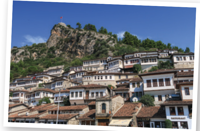
City of 1,000 Windows in Berat, Albania