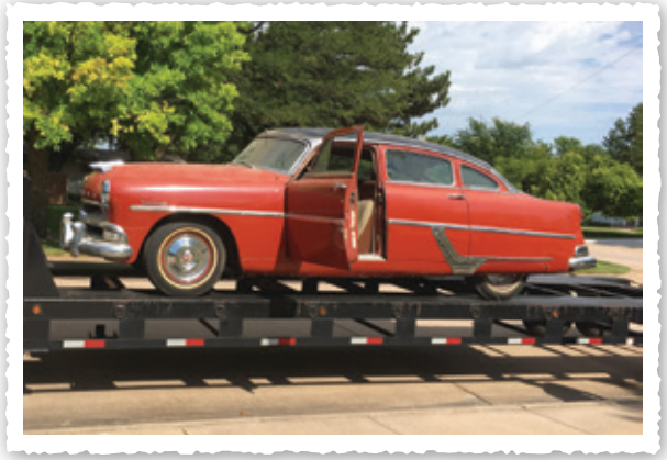
A '54 Hudson Hornet, on its way back to the future

I returned the car all cleaned up to Dad after I reconnected the odometer. All