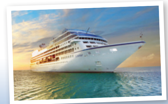
The Oceania Sirena

That's when I discovered a comprehensive 85-day cruise to the Mediterranean on the mid-size Oceania Sirena ship, leaving Miami on June 23, 2018, and returning to Miami on Sept. 16, 2018.