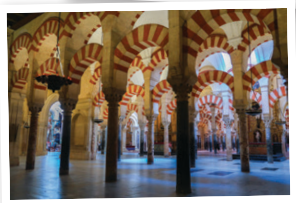
Mesquite Mosque Cathedral in Cordoba, Spain