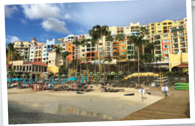
St. Croix, U.S. Virgin Islands

50s to mid-80s. NEA — and FEMA — value previous and current work experience over age.