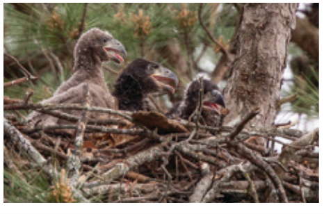
A nestful of newcomers

Normally, eagles work very hard to keep two eaglets fed. Now with three, they were busy all the time taking food to the nest.