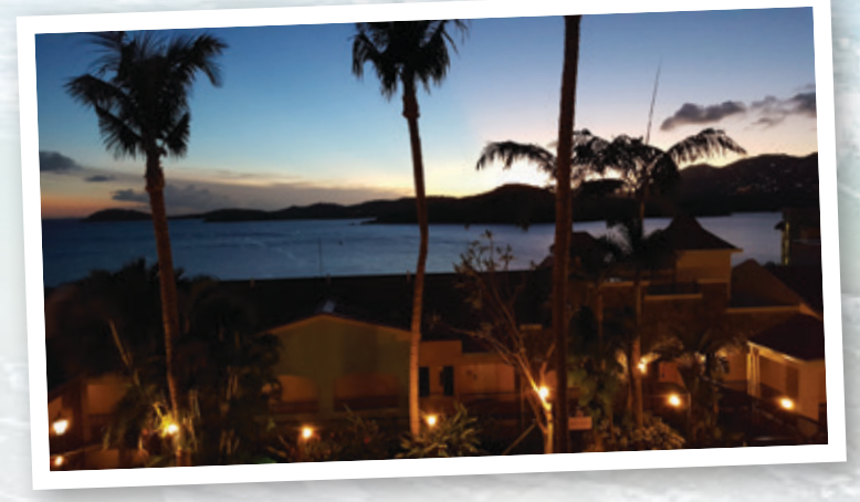
Sunset on St. Thomas

They have monitored debris removal from shrimp boats in the Gulf of Mexico. They have flown in helicopters and charter planes to be able to see the varied damages. They have experienced white-out blizzards in October and the results of horrendous tornados and flooding. They have stayed in accommodations ranging from not-so-clean motels to vacation condos on the beach.