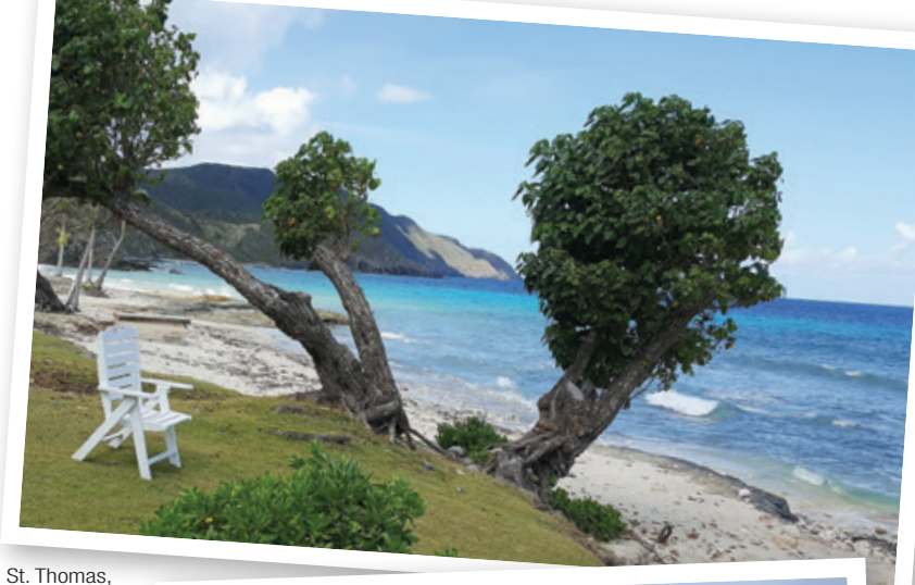
St. Thomas, U.S. Virgin Islands

Because most NEA employees begin as retirees, the workforce is an older group. Employees are in their early