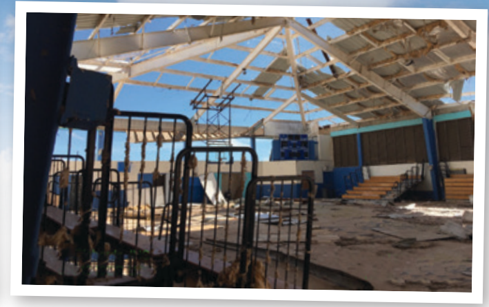
Hurricane damage on St. John, U.S. Virgin Islands

They have eaten deli reubens in the Northeast, oysters in the Northwest, flatbread in the Southwest, lutefisk in the Midwest, and cracklins in the South. They say they have found that each state, each city, each town has its own beauty and its own good people.