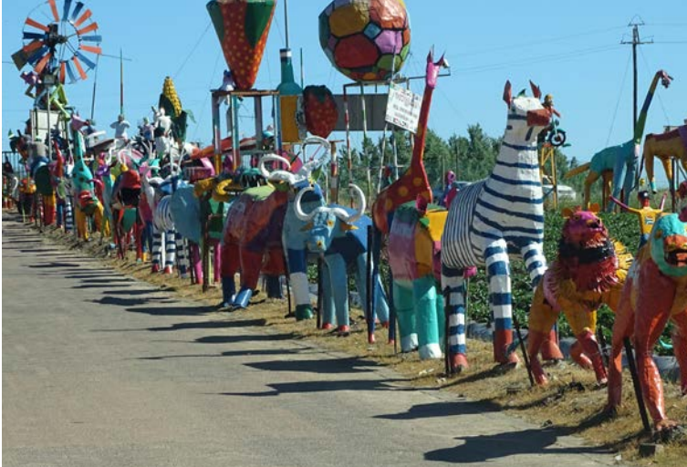
Safari...continued from page 9

the elusive black rhinoceros (or hooklipped rhinoceros), which is classified as critically endangered.