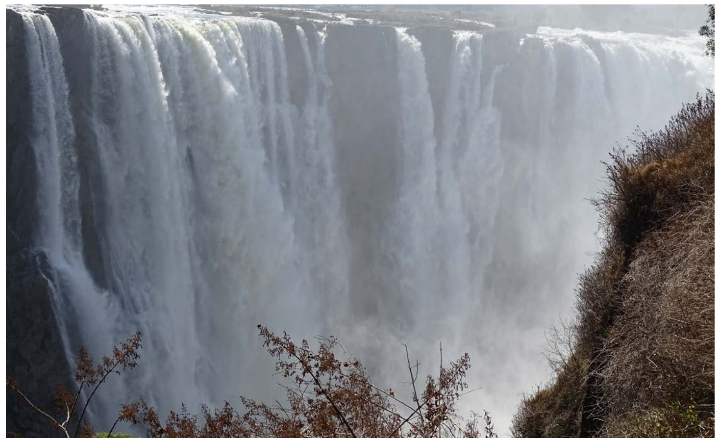
Victoria Falls lives up to its nickname, "smoke that thunders."

We passed many fields of banana, orange, and avocado trees. These farmers protect their crops with highquality fencing integrated with razor wire. To my amazement, many of the banana farms resembled prisons rather than farms.