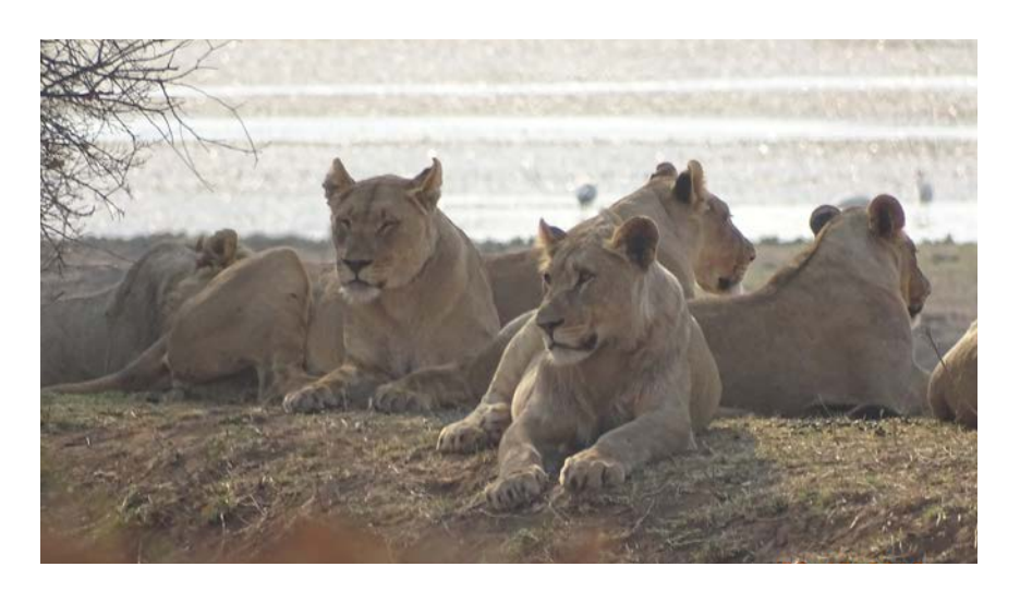
Clockwise, from top left, sights to see along the way — a water buffalo, a roadside "parade," a zebra, and lounging lionesses