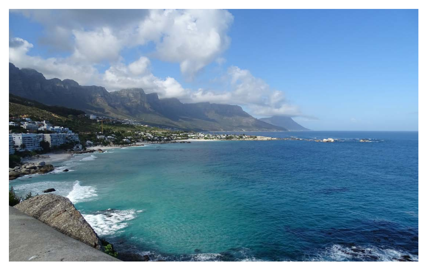
The wonders of this region are as diverse as a beautiful coastline and a group of gangly giraffes.